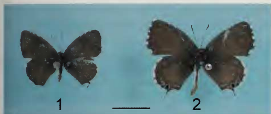
Figs. 1–2. Cacyreus marshalli , Greece, upperside. 1.–♂, Athens, Maroússi, 300 m, 20.xii.2009; 2.–♀, Athens, Maroússi, 300 m, 30.xii.2009. Scale bar: 1 cm.

hitherto known location of occurrence, i.e. Mali Lošinj, it is very unlikely that the species has arrived from Croatia through the Balkans. It is much more probable that it was accidentally introduced through imported Pelargonium transplants, as originally was the case in the Balearic Islands.